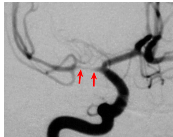
Figure 2. Angiogram shows a narrowing of the middle cerebral artery (red arrows) caused by atherosclerotic plaque.